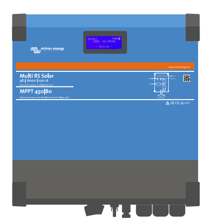
Multi RS Solar 48/6000